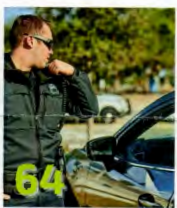
PEACE OFFICERS TRAINED

Stay tuned for the launch of a new online ETCOG Regional Solutions Performance Portal where you can see a snapshot of key performance deliverables within a fiscal year. Members will receive an email about accessing the new portal.